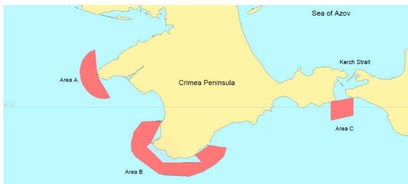
The areas of suspended innocent passage for warships. 82

In a second Russian infringement, the latter temporarily closed off certain parts of the Black Sea to other ships – albeit the term “temporarily” was interpreted rather broadly. According to its announcement, waters surrounding the Crimean Peninsula and the Kerch Strait would be closed from 24 April 2021 until 31 October 2021. 83 During the suspension, navigation by all foreign warships, but not civilian ships, was prohibited. 84