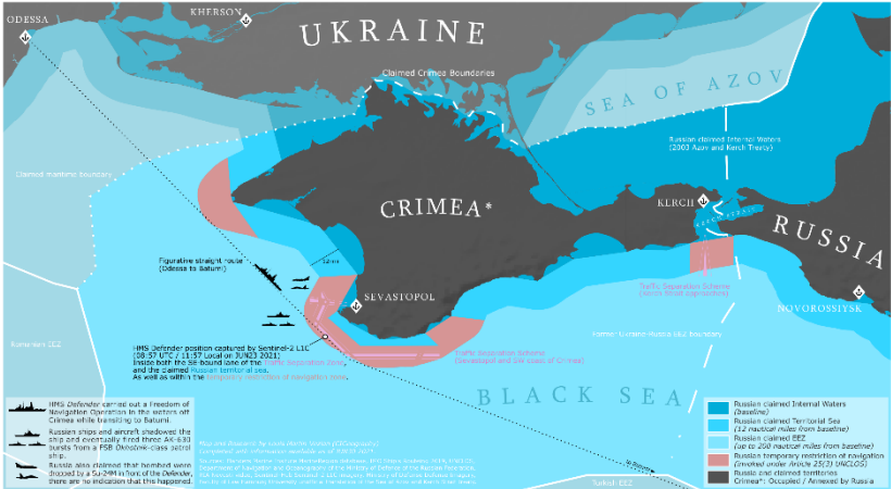
The route followed by the HMS Defender through the restricted area. 89

innocent passage can only serve as a temporary measure, with doctrine generally considering a period of months as taking the meaning behind the provision too far. 88