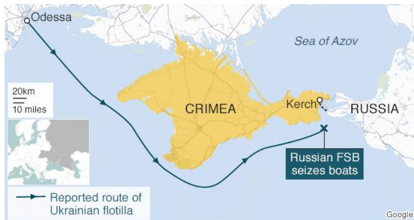
The route of the three Ukrainian Navy vessels. 74

For Russia, the Black Sea is already a theatre of war, 69 it is an area of significant geostrategic importance 70 and the springboard for projecting power into the Middle East and the Mediterranean. 71 Since its illegal annexation of Crimea in 2014, Russia has steadily begun treating the Sea of Azov and the Black Sea as Russian lakes – or de facto closed seas where it is free to determine the legal regime. 72 In what follows, three specific case studies dealing with the free navigation of warships in innocent passage will be discussed: (1) the case concerning three Ukrainian Naval Vessels (2) the Russian closure areas and (3) the HMS Defender incident. 73